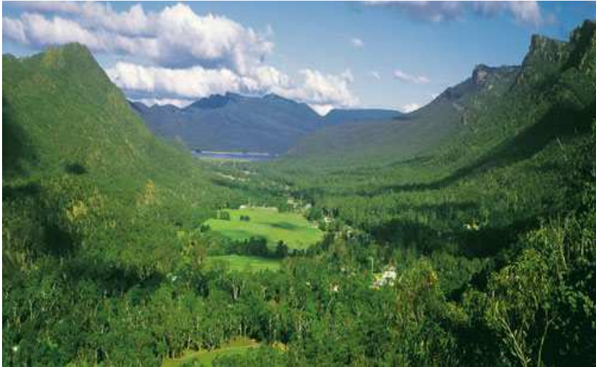
Spectacular Halls Gap, Grampians National Park, Western Victoria

Set in Halls Gap, with its spectacular vistas, in Grampians National Park, Western Victoria, Grampians Brushes , a non-profit arts organisation based in Horsham, offers a unique opportunity for artists to develop their skills through an extensive series of inspirational workshops to be held from 8 -13 September 2012.